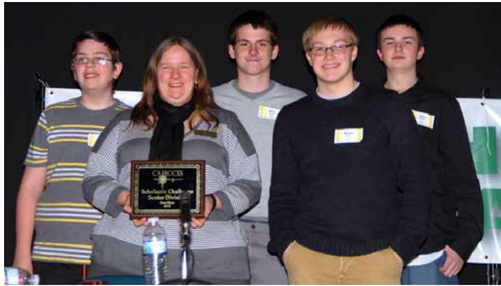
The Wellsville Goblins won first place in this year's Scholastic Challenge.

In the Senior Division, the two Wellsville teams competed against 25 others. The