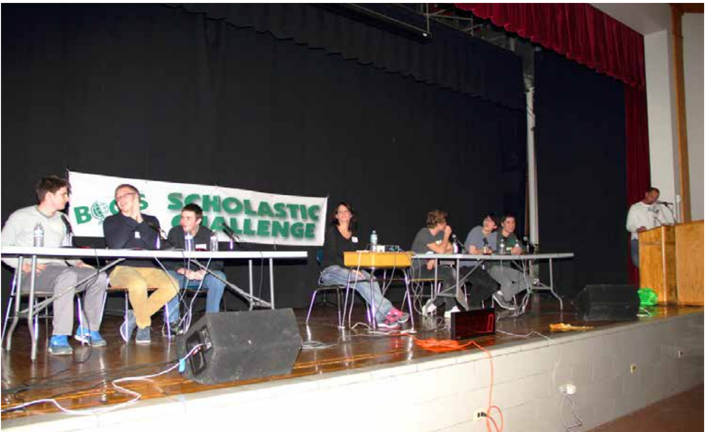
The Wellsvsille Goblins squared off against thePioneer Starfleet Academy in the Senior Finals on stage in the Portville Central School Auditorium.