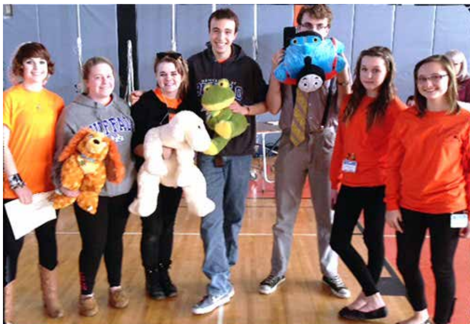
This team represented Wellsville Central School at last year's World Finals for Odyssey of the Mind held last May at Michigan State University.

Problem 1: Driver's Test -- Teams will design, build, and drive a vehicle that will travel a course where a student driver attempts to complete tasks in order to pass a driver's test. The vehicle will travel using