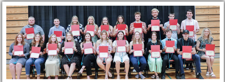
CLASS OF 2022