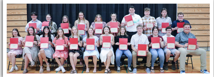
CLASS OF 2023