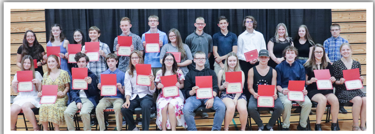
CLASS OF 2024