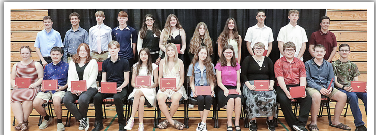
CLASS OF 2025