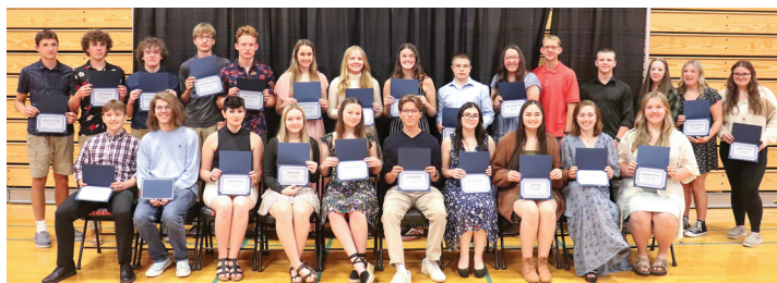
CLASS OF 2024