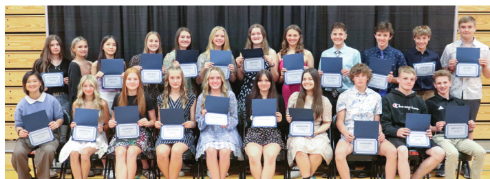
CLASS OF 2026