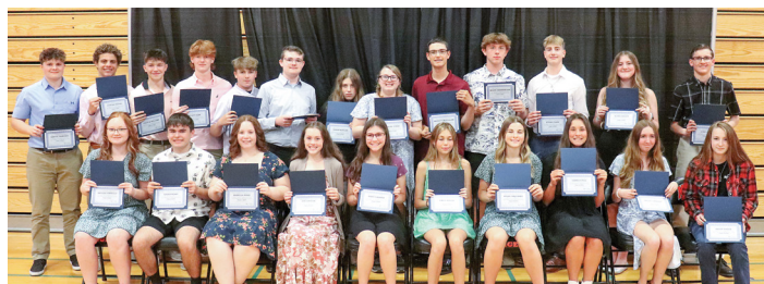
CLASS OF 2025