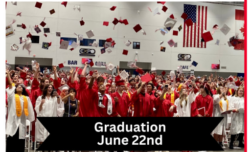
Graduation June 22nd