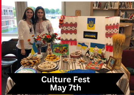
Culture Fest May 7th