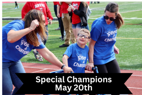
Special Champions May 20th