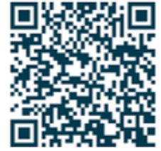
Student Parking Application

The next free class will be offered via Zoom on Monday, Feb. 19 at 9:00 AM . Sign up by Friday, Feb. 16. Stop by the Main Office to receive the Zoom meeting registration link.