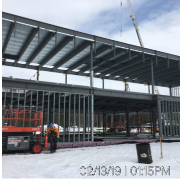
02/13/19 | 01:15PM