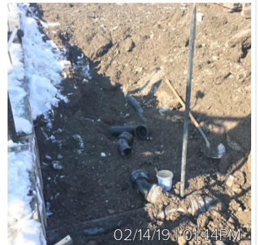
02/14/19 | 01:44PM