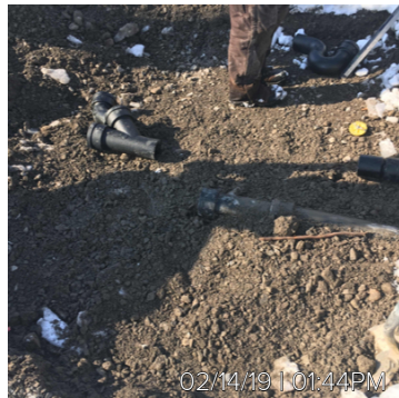
02/14/19 | 01:44PM