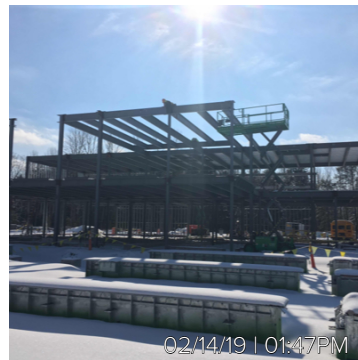
02/14/19 | 01:47PM