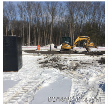
02/14/19 | 01:47PM