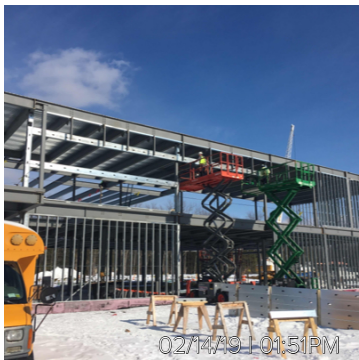
02/14/19 | 01:51PM