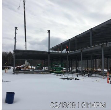
02/13/19 | 01:14PM