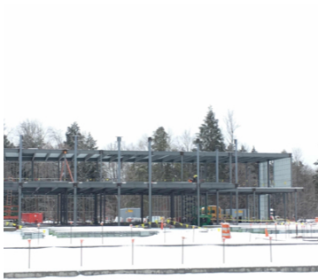
02/13/19 | 01:18PM