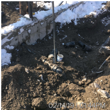
02/14/19 | 01:44PM