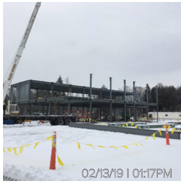
02/13/19 | 01:17PM