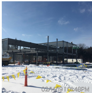
02/14/19 | 01:48PM