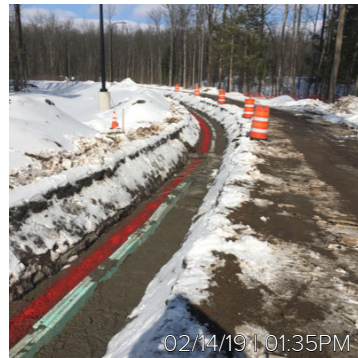
02/14/19 | 01:35PM