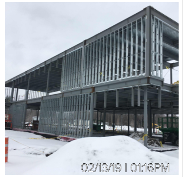
02/13/19 | 01:16PM