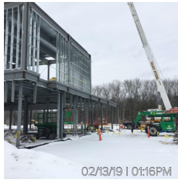
02/13/19 | 01:16PM