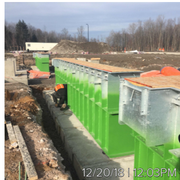
12/20/18 | 12:03PM