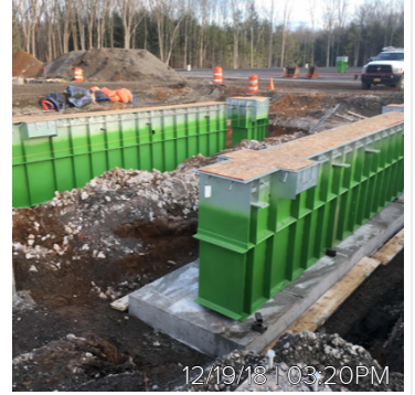
12/19/18 | 03:20PM