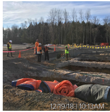
12/19/18 | 10:13AM