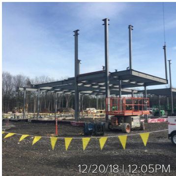
12/20/18 | 12:05PM