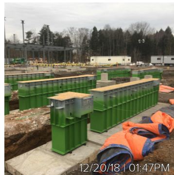
12/20/18 | 01:47PM