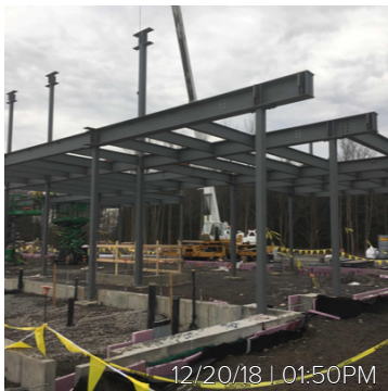
12/20/18 | 01:50PM