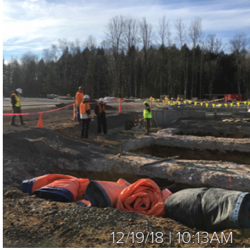
12/19/18 | 10:13AM