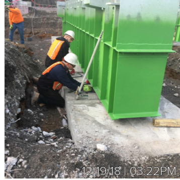
12/19/18 | 03:22PM