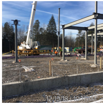
12/19/18 | 10:17AM