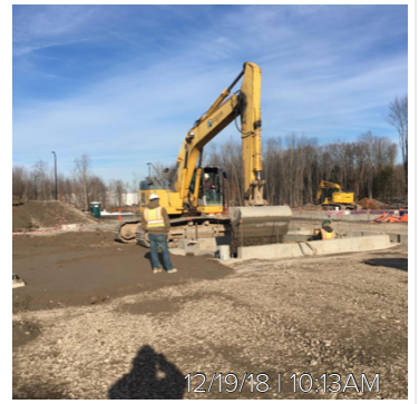
12/19/18 | 10:13AM