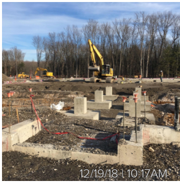
12/19/18 | 10:17AM