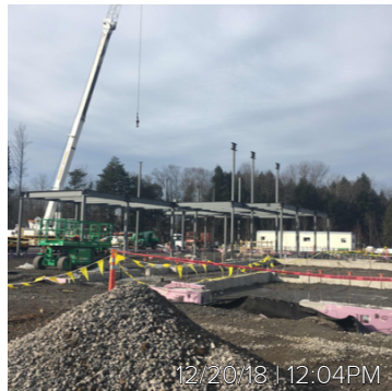
12/20/18 | 12:04PM