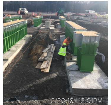
12/20/18 | 12:01PM