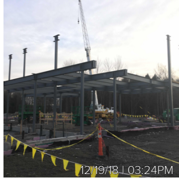
12/19/18 | 03:24PM