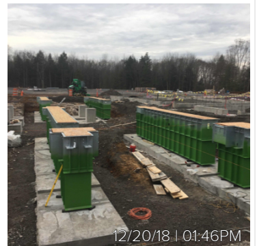
12/20/18 | 01:46PM