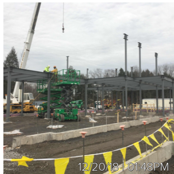
12/20/18 | 01:48PM