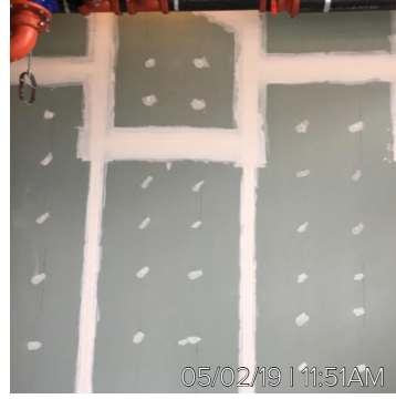
05/02/19 | 11:51AM