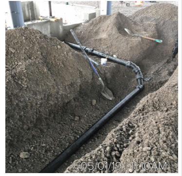
05/01/19 | 11:10AM