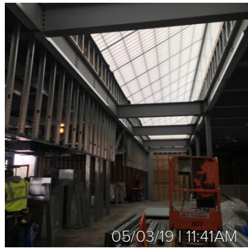
05/03/19 | 11:41AM