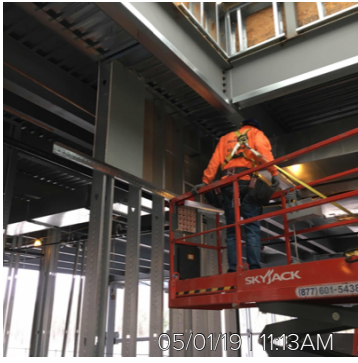
05/01/19 | 11:43AM