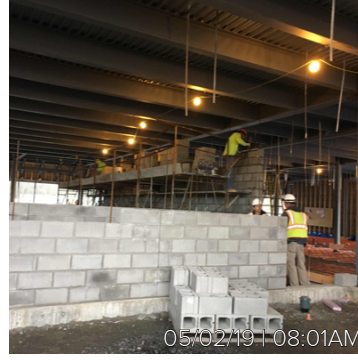
05/02/19 | 08:01AM