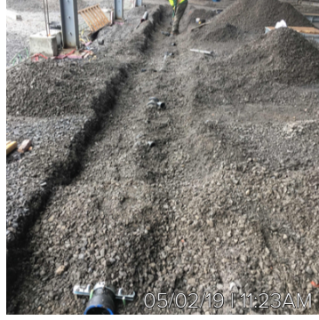
05/02/19 | 11:23AM