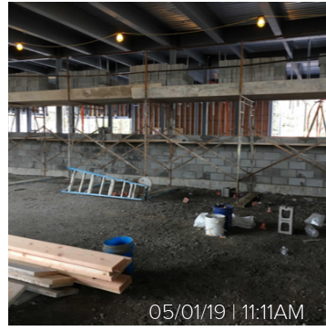
05/01/19 | 11:11AM