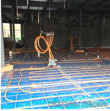
05/02/19 | 11:50AM