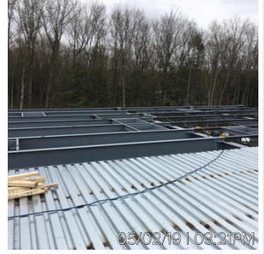
05/02/19 | 08:21PM