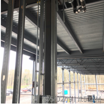
05/02/19 | 11:53AM