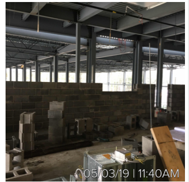
05/03/19 | 11:40AM