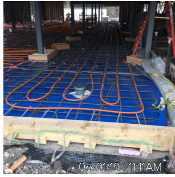
05/01/19 | 11:11AM