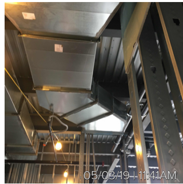
05/03/19 | 11:41AM