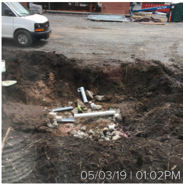
05/03/19 | 01:02PM