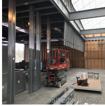
05/02/19 | 11:52AM