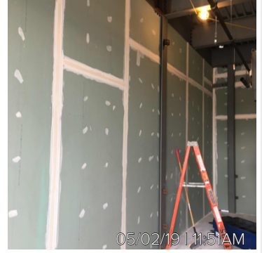
05/02/19 | 11:51AM