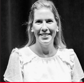
Elizabeth Boyle Ray Middle