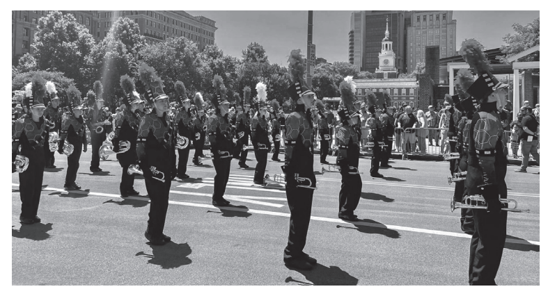
The Marching Bees performed in Philadelphia for 4th of July.

NYSPHSAA Outdoor Track & Field Championship