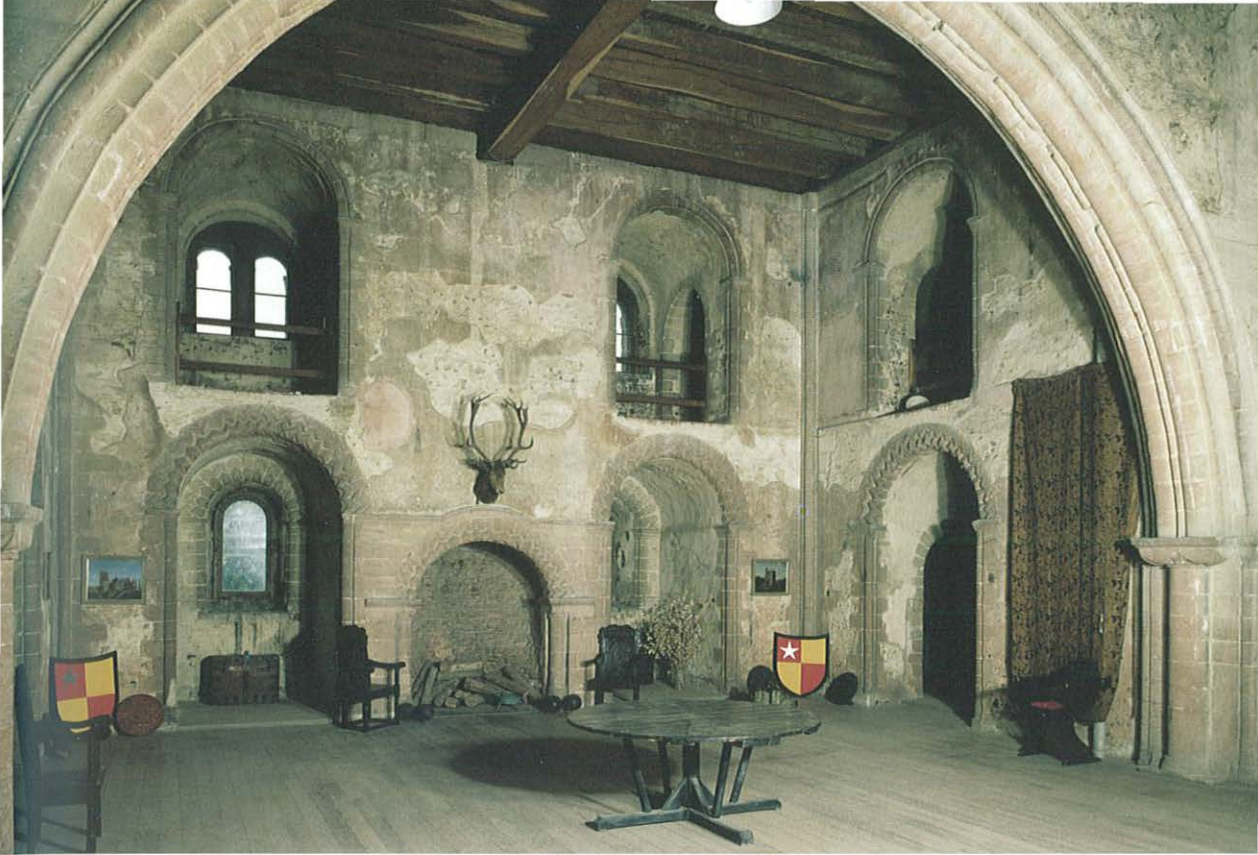
The great hall of Hedingham Castle, in Essex, England, features an arch spanning twenty-eight feet. In this room, meetings, ceremonies, and banquets took place.

and activity on a typical feudal manor. Inside the castle or manor house, the principal room was the great hall , though it was more often called simply “the hall.” (Sometimes people referred to the entire castle or house as a hall.) In the earliest castles, the great hall consisted of a very large chamber with a high ceiling. It contained numerous tables, chairs, and benches , which the servants rearranged as need dictated, as well as tapestries on the walls (partly for decoration, but also to help keep the room warm). The lord of the castle used the hall to transact busi-