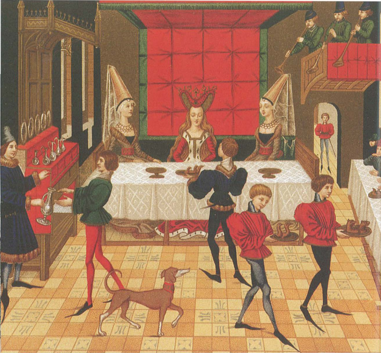
Servants scurry to and fro, waiting on the lady of a medieval French manor and her guests. The largest manors had staffs featuring dozens of servants.

pray and meditate, small chambers to house the family's servants, storerooms, and stables and other outbuildings adjoining the main house. In the early twelfth century, a French writer named Lambert of Ardres penned this description of a fairly typical manor house of the time: