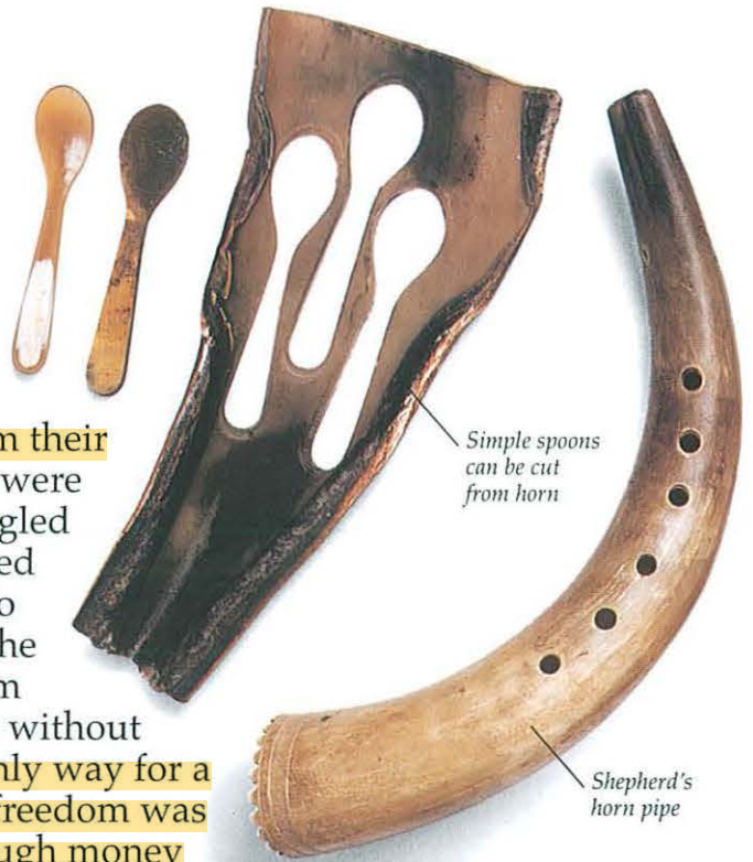
Simple spoons can be cut from horn

ACCORDING TO THE LAW, medieval peasants did not belong to themselves. Everything, including their land, their animals, their homes, their clothes, and even their food, belonged to the lord of the manor (p. 14). Known as serfs or villeins, peasants were bound to work for their lord, who allowed them to farm their own piece of land in return. Their lives were ones of almost constant toil. Most struggled to produce enough food to feed their families as well as to fulfill their duties to the lord. Forbidden from leaving the manor without permission, the only way for a peasant to gain freedom was by saving enough money to buy a plot of land, or by marrying a free person.