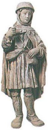
Statue of a French peasant, c. 1500

ACCORDING TO THE LAW, medieval peasants did not belong to themselves. Everything, including their land, their animals, their homes, their clothes, and even their food, belonged to the lord of the manor (p. 14). Known as serfs or villeins, peasants were bound to work for their lord, who allowed them to farm their own piece of land in return. Their lives were ones of almost constant toil. Most struggled to produce enough food to feed their families as well as to fulfill their duties to the lord. Forbidden from leaving the manor without permission, the only way for a peasant to gain freedom was by saving enough money to buy a plot of land, or by marrying a free person.