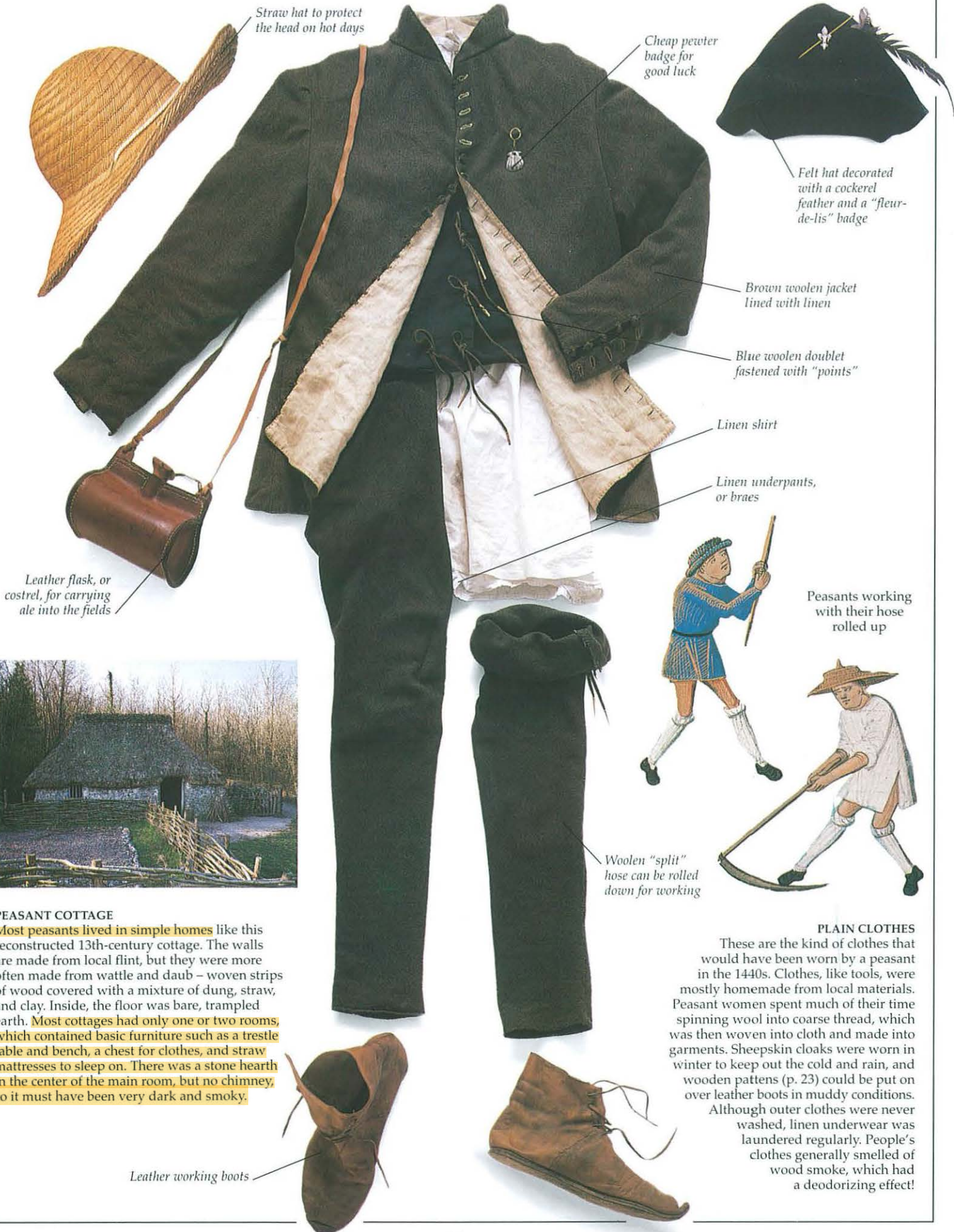
Straw hat to protect the head on hot days