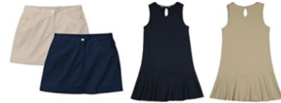
Khaki or navy pants, capri pants, shorts, skirts, or jumpers