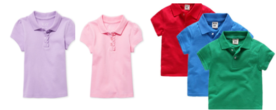
Collared polo shirt in any solid color (school logo is optional)