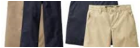
Khaki or navy pants and shorts