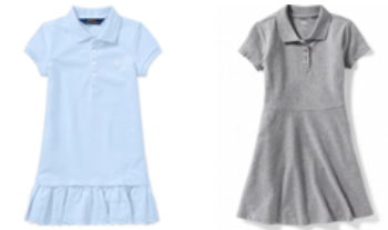
Any solid color polo dress