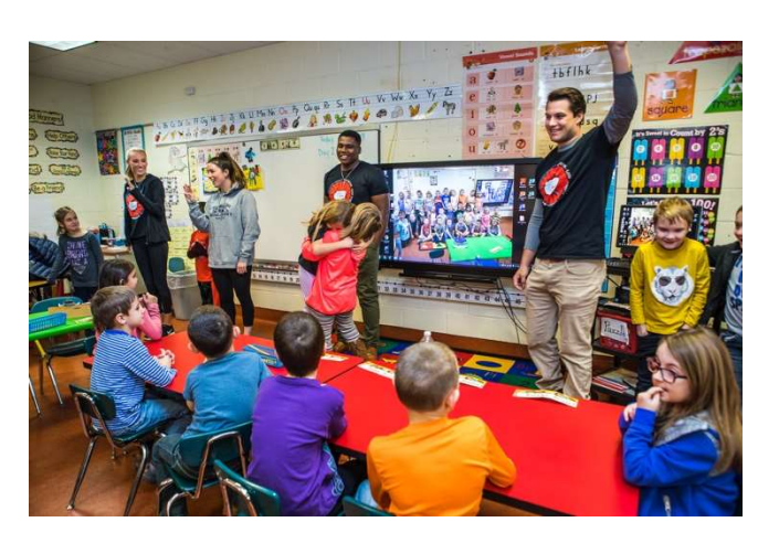
'Mentoring Madness' Gives Northern New York Students a Leg Up on College

CFES Brilliant Pathways is a non-profit organization based in Essex, NY that works with school districts throughout the United States to help students become college and career ready. Since its start in 1991, CFES has helped nearly 100,000 students from 1,500 schools discover new career pathways and the tools necessary to make informed decisions about postsecondary education. We achieve these goals by exposing students to different careers and teaching them essential skills and how to use them.