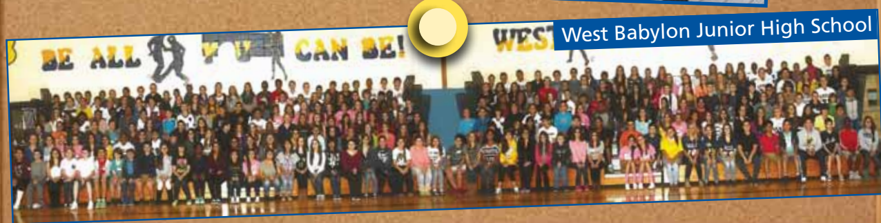
West Babylon Junior High School