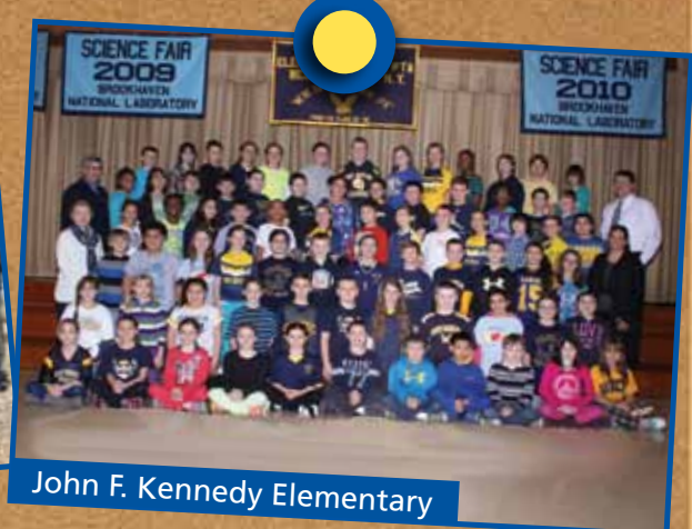
John F. Kennedy Elementary