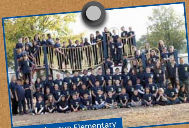
Forest Avenue Elementary