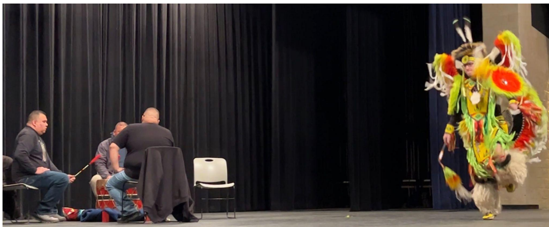
Above: Members of the Rosebud Tribe brought their talents to VHS on January 25th.

I am looking forward to seeing you on Wednesday afternoon.