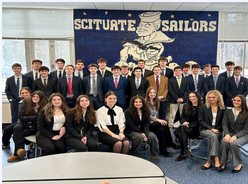
Scituate High School DECA Team Departing to the Boston Convention Exhibition Center

The Scituate DECA Chapter returned home triumphant on Saturday, March 1, from the 66th annual Massachusetts DECA State Career Development Conference (SCDC) at the Westin Seaport and Boston Convention & Exhibition Center (BCEC) with 9 students qualifying for the International Career Development Conference (ICDC) in Orlando, FL. Thirty-Three Scituate High School students joined over 4,000 students, advisors, and business professionals for the 3-day conference where students competed in over 50 categories of marketing, hospitality, finance, and entrepreneurship.