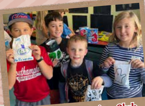
Community Service Club