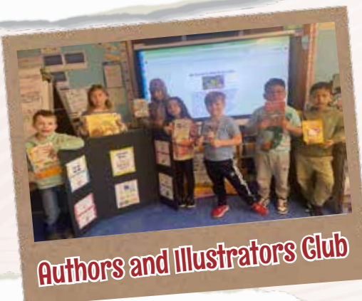
Authors and Illustrators Club