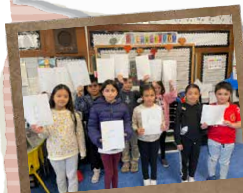
Spelling Bee Club