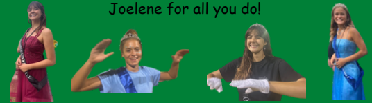
All Students recognized in the student spotlight receive a free meal from Sierra Energy/Squeeze Burger