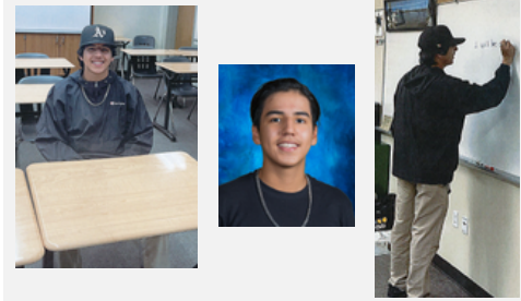
All students recognized in the student spotlight receive a free meal from Sierra Energy