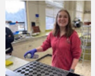
All students recognized in the student spotlight receive a free meal from Sierra Energy