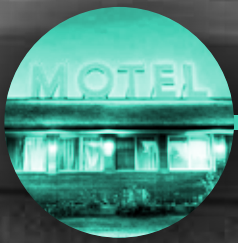
HOTEL OR MOTEL