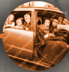
CAR OR RV