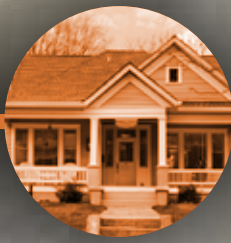
FRIEND OR RELATIVE'S HOUSE