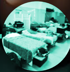
SHELTER OR TRANSITIONAL HOUSING