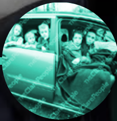
CAR OR RV