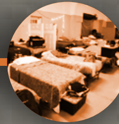
SHELTER OR TRANSITIONAL HOUSING