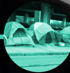
STREET OR TENT