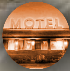
HOTEL OR MOTEL