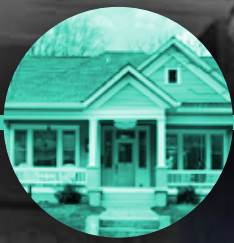
FRIEND OR RELATIVE'S HOUSE