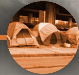
STREET OR TENT