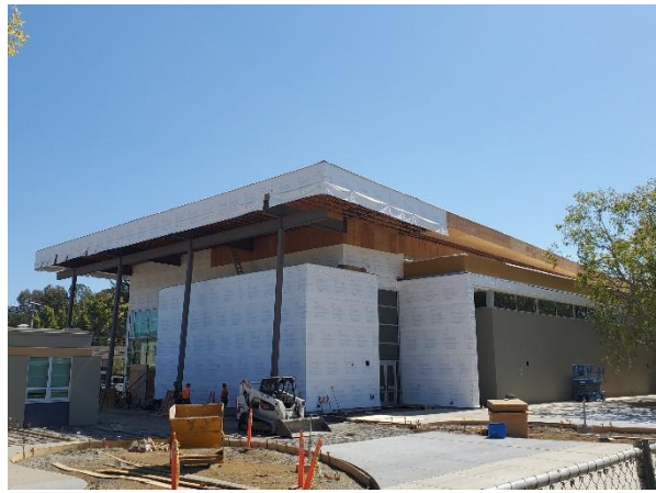
Gymnasium view from quad