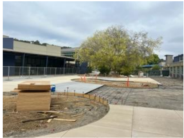
Quad area that is newly paved and landscaping in process