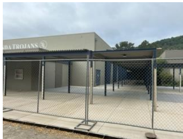
PE/ Existing Gym Area that is newly paved all the way over to the Performance Hall