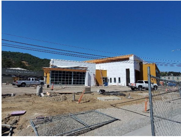
Gymnasium front view from street Completion expected January 2023