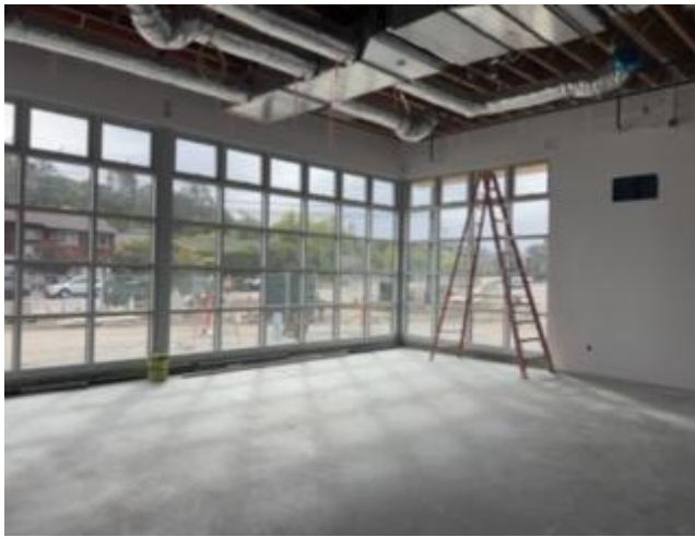
Conditioning Room in Gymnasium