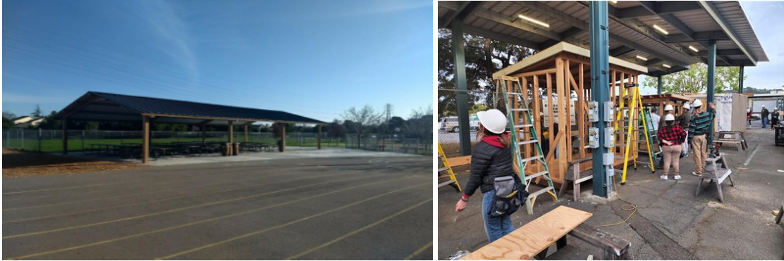
Example of Outdoor Workshop Structures (similar to what is proposed for Marin CTE Center)

Through a partnership between the Marin County high school districts and the Marin County Office of Education, the new Marin Career Technical Education (CTE) Center, located on the campus of Terra Linda High School, in San Rafael, will open to students countywide this spring. The Marin CTE Center will expand the variety of available CTE courses and increase student accessibility by offering classes in the afternoons, evenings, and weekends, and providing transportation options across the county. This project is being funded through the Marin County Office of Education in partnership with private donors.