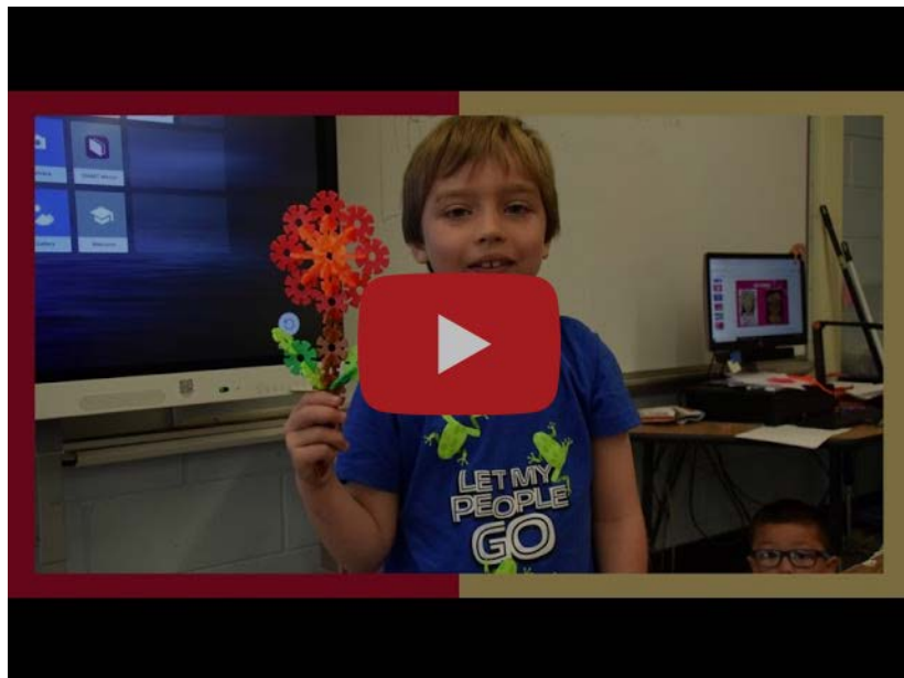
A Look Inside Our Schools: Summer 2023 Recap