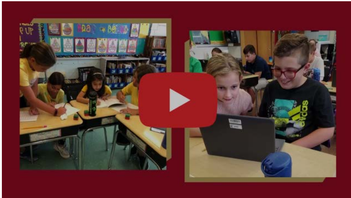
A Look Inside Our Schools: October Recap

each made donations in the name of the Sachem Board of Education to local nonprofits as a way to express their gratitude for the continuous contributions the Board has made to the Sachem Central School District.