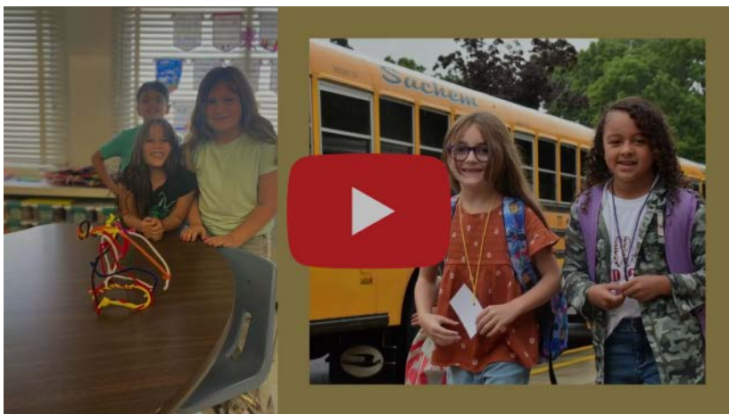
A Look Inside Our Schools: September Recap