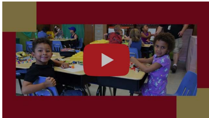
A Look Inside Our Schools: Summer Recap