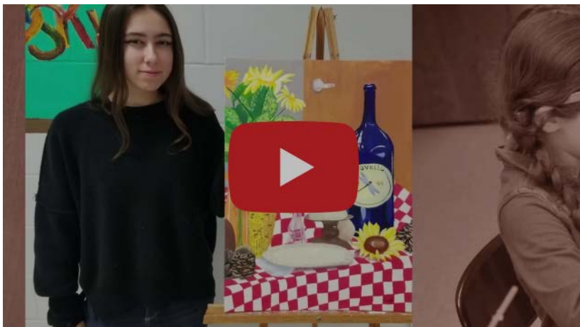
A Look Inside Our Schools: March Recap