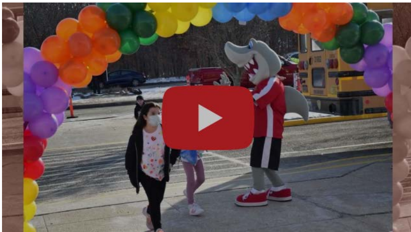
A Look Inside Our Schools: February Recap

place in the top three in their specific category, three of which earned first-place honors.