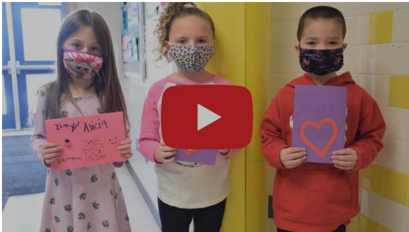
Video: Sachem Celebrates P.S. I Love You Day

Across the Sachem Central School District, students and staff collectively blanketed the district in purple attire and heartwarming lessons and activities in a special show of support for mental health awareness, as part of the annual celebration of P.S. I Love You Day on the second Friday in February.