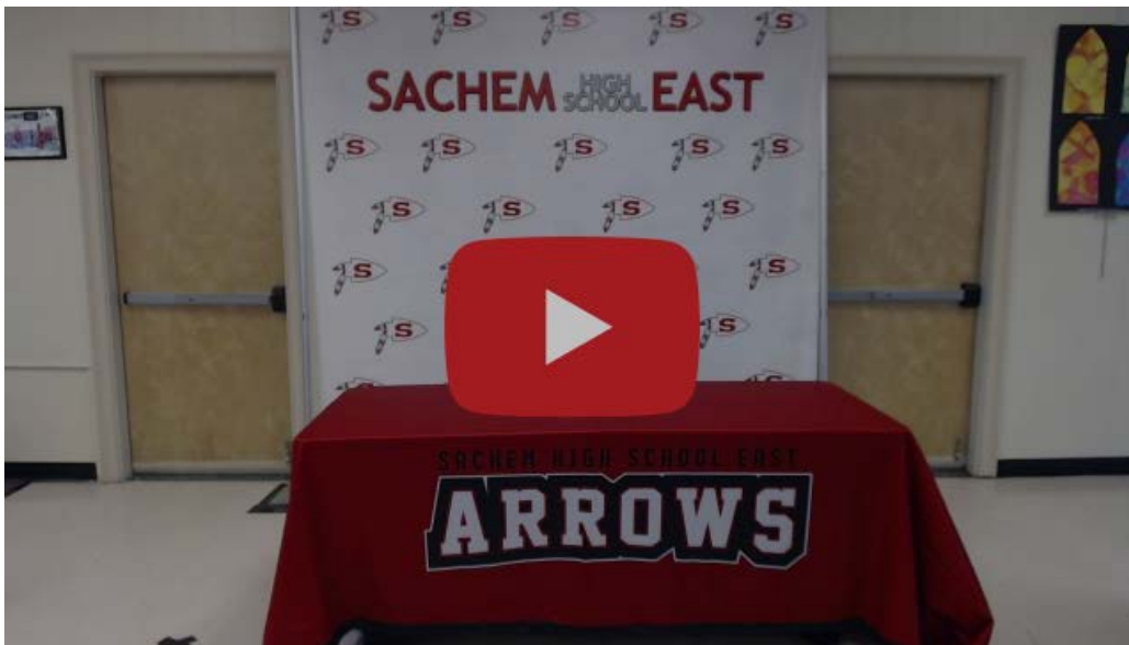
Sachem High School East Athletic Signing