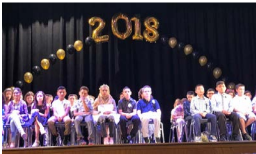
Hiawatha Elementary School - Watch Video