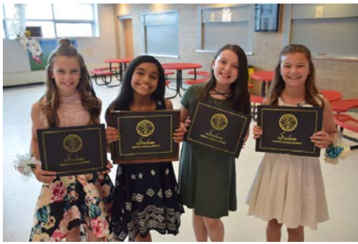
Chippewa Elementary School - Watch Video