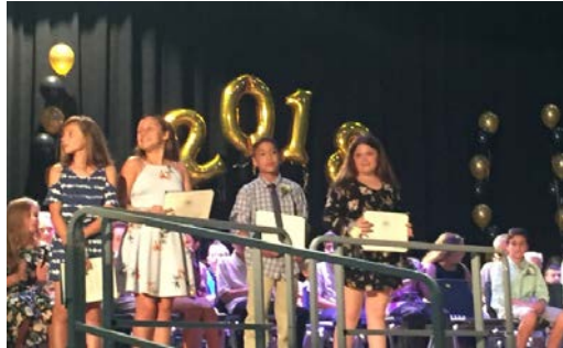
Grundy Avenue Elementary School - Watch Video