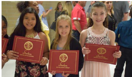
Lynwood Avenue Elementary School - Watch Video