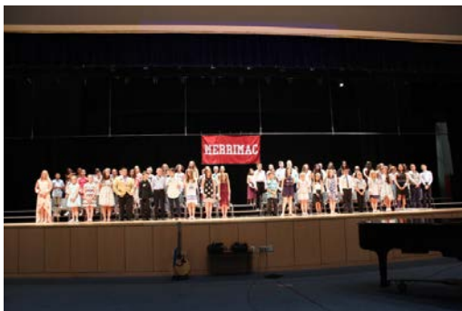
Merrimac Elementary School - Watch Video