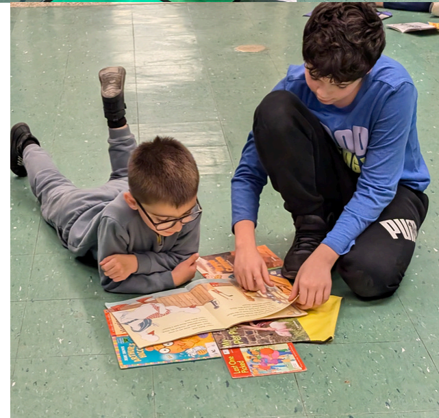
First and Fifth Grade Reading Buddies