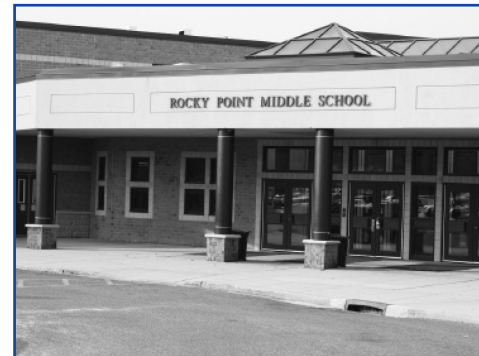
Rocky Point Middle School Grades 6-8