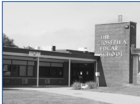
Joseph A. Edgar Intermediate School Grades 3-5