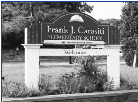
Frank J. Carasiti Elementary School Grades K-2

Be sure to "follow" the district's official Instagram page by searching "Rocky Point Schools" or scanning the QR code to the left.