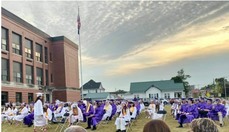
Royalton-Hartland Graduation 2021