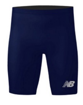
Men's Half Tights $40.00