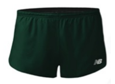
Women's Running Shorts $29.50

- Boys have 3 options, you only have to get one.