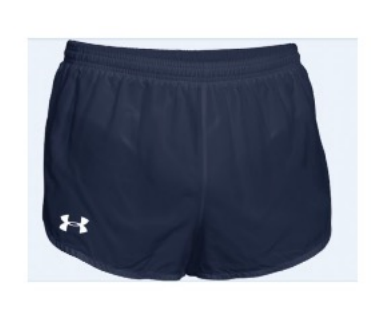
Men's Split Shorts $34.50