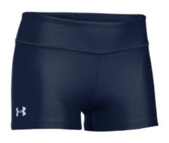
Women's Boyshort $21.50