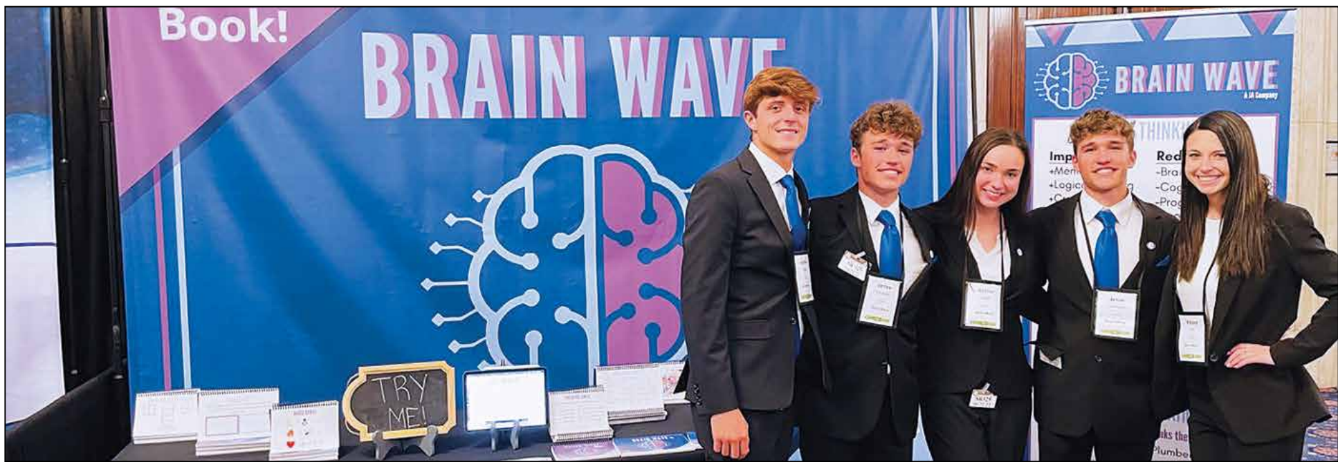
Brain Wave participants representing Hoover High School at the JA National Student Leadership Summit Trade show expo at the Russell Senate Building in Washington D.C.