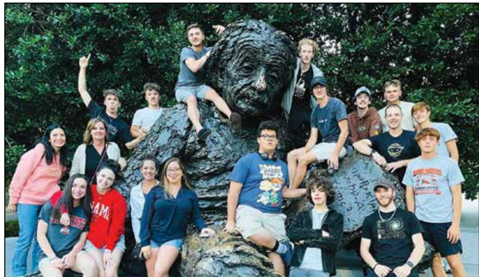
Students from Hoover and Lake High Schools along with their teachers and representatives from JA of North Central Ohio enjoy some free time in Washington D.C. visiting the Albert Einstein Memorial.