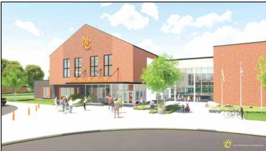
Intermediate School (Grades three through five) on East Maple Street

The Charlotte building’s layout was done in a way that allows it to serve as a gateway and welcome to our community to visitors from I-77. It will serve as the transition from the neighborhoods to the Main Street Corridor.