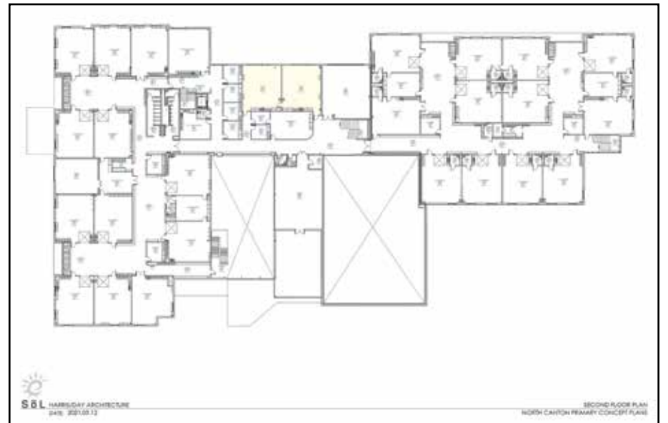
Primary School Second Floor Plan