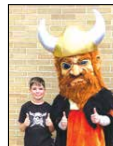
On to the Middle School!

The fifth-grade "Movin' on Up" Party was hosted by fifth-grade parents immediately following the awards ceremony. It was a day of celebration and closure for an amazing group of students who will be missed here at Orchard Hill.