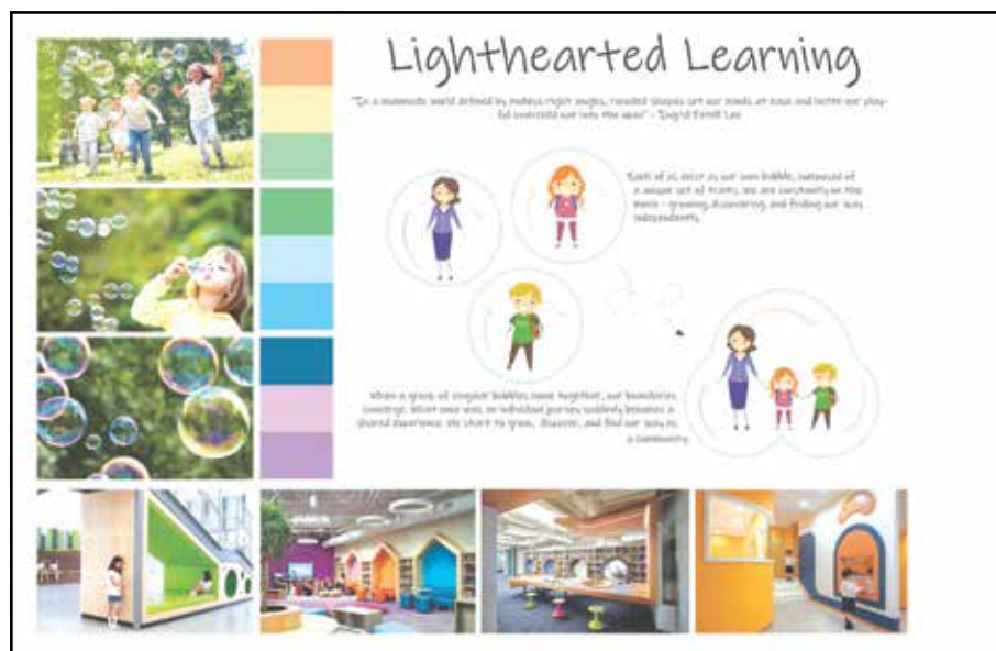
Primary School Color Palette

Currently, the architects have finished the building design and layouts. You can go the following link to see the animated concept view of the new buildings: https://www.northcantonschools.org/DistrictFacilitiesProject.aspx