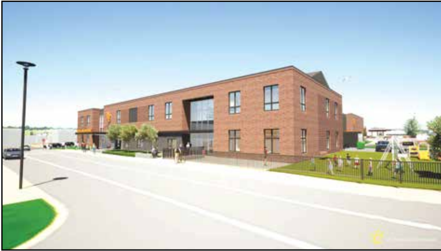
Primary School (Pre-K through Grade two) on Charlotte Street

The new buildings will have a similar, yet unique design that sets them apart from one another. The brick construction of each building will fit well in the traditional North Canton neighborhoods.