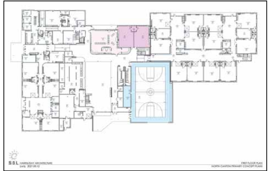
Primary School First Floor Plan

The first sign of progress that will be visible to the public will occur late this summer when the construction fences are erected around the new buildings sites and excavation work begins to ready the ground for each of these two new buildings. Basements are not part of modern-day school construction. Each of the two buildings will have a second-story component to them, but common areas such as lunch rooms, libraries, music rooms and gyms will all be located in a central area on the first floor.