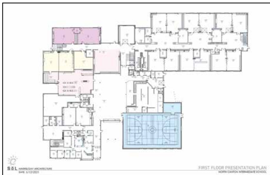
Intermediate School First Floor Plan

Final details such as interior wall and floor colors, playground equipment, and classroom furniture will start to be handled in the final nine months before opening.