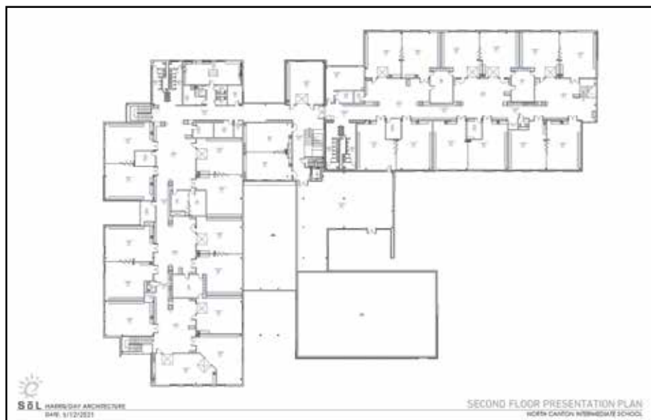
Intermediate School Second Floor Plan

Some of the other points of emphasis we have asked the architects to keep in mind is keep our morning and afternoon drop-off and pick-ups safe and efficient for parents. Our current buildings built in the 1950's and before never accounted for hundreds of students being dropped off and picked up each day. These buildings are being planned with that in mind, and effort has been made to completely separate bus traffic and parent traffic to opposite ends of the building. This is an area where safety and efficiency certainly go hand in hand.