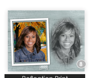
8x10 Reflection Print. Your

At-a-glance 8x10 - 12 month calendar (2021).