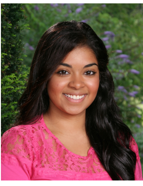
~Exquisite outdoor portraits at your school~