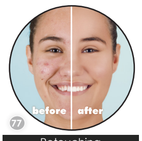
Retouching Image retouching will reduce and soften the appearance of minor facial blemishes.

A 30 OR 110 piece portrait puzzle on a hardboard backer.