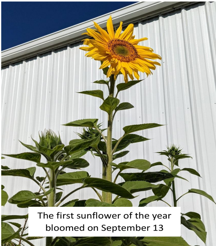
The first sunflower of the year bloomed on September 13