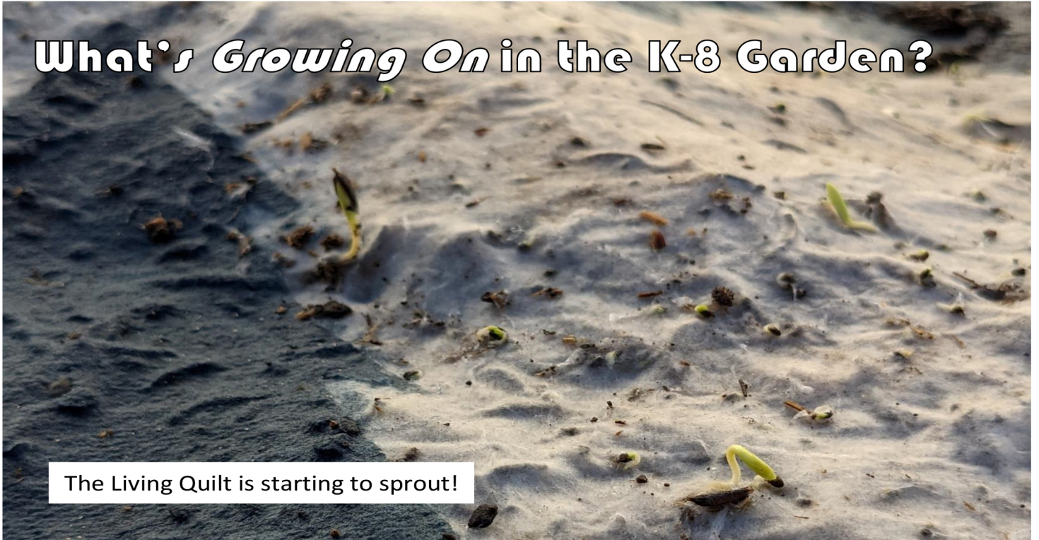
The Living Quilt is starting to sprout!