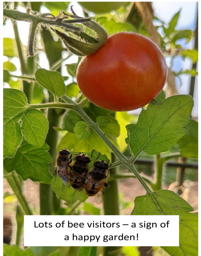
Lots of bee visitors – a sign of a happy garden!