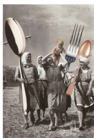
Silly Collage Postcards