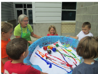
Marble Roll Painting