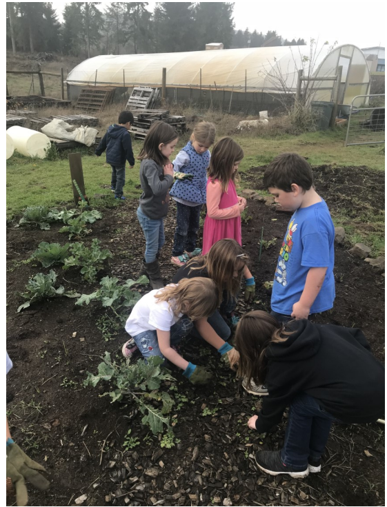
Photos from Garden and Nutrition lessons in November and December