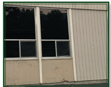
Water damaged siding at Mill Valley Middle School