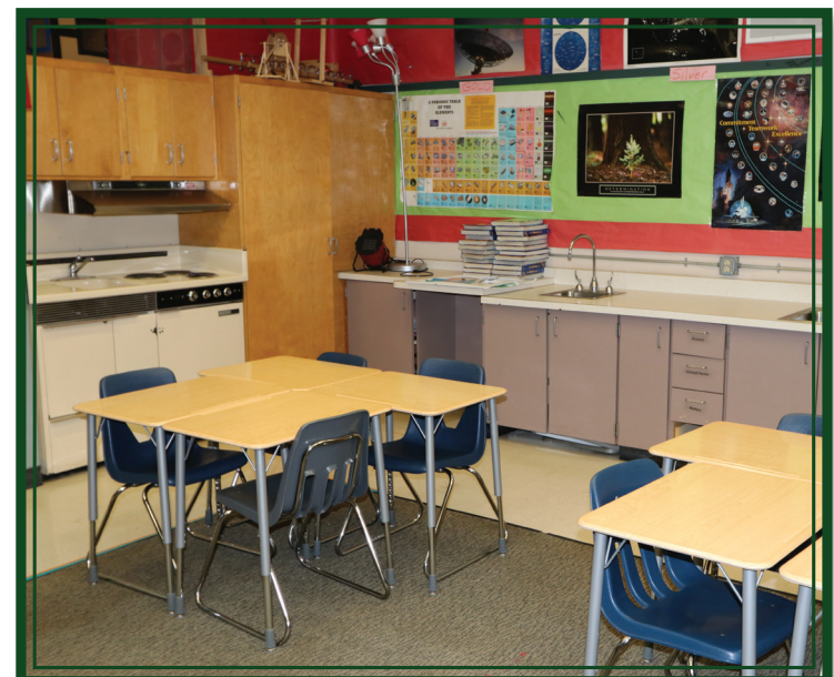
Outdated science classroom at Mill Valley Middle School