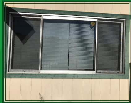
Aging portables at Old Mill Elementary School