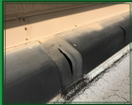
Damaged rooftop at Strawberry Elementary School