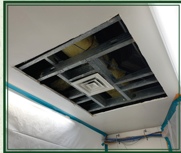
Ceiling damage from recent storm at Mill Valley Middle School

Superintendent, Mill Valley School District