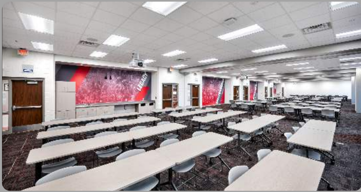
Paul Logan Fieldhouse Community Rooms

Over the last two years, we have made significant progress on the renovation projects at North Central. We have completed a full renovation of the auditorium, constructed the Paul Logan Fieldhouse, upgraded classrooms, and enhanced site safety and circulation around the campus. Additionally, we have completed the construction of a new soccer press box and installed new field lighting and scoreboards. Substantial improvements have also been made to the Football Stadium, including new handicap accessible bleachers, a new press box, updated lighting, a new scoreboard, and a new building featuring visitor restrooms and concessions.