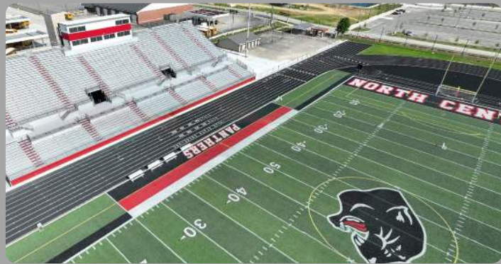
NCHS Stadium Home Side

Over the last two years, we have made significant progress on the renovation projects at North Central. We have completed a full renovation of the auditorium, constructed the Paul Logan Fieldhouse, upgraded classrooms, and enhanced site safety and circulation around the campus. Additionally, we have completed the construction of a new soccer press box and installed new field lighting and scoreboards. Substantial improvements have also been made to the Football Stadium, including new handicap accessible bleachers, a new press box, updated lighting, a new scoreboard, and a new building featuring visitor restrooms and concessions.