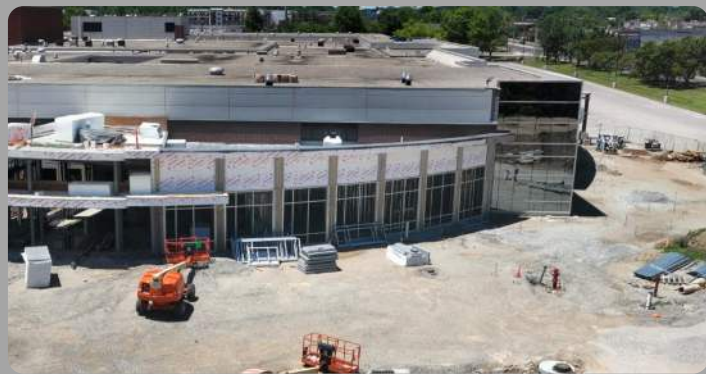
New NCHS Main Entrance

As with every phase of our projects, the design process for the Football Stadium involved careful scrutiny of the scope and related costs to ensure accountability to the taxpayers of our community. Due to budget constraints caused by the impact of inflation on construction costs, the significant reduction of renovation work for our visiting team facilities had to be reduced to remain within budget. The expanded scope will be considered for future public and private sector funding.