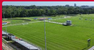
New Soccer Press Box