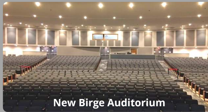
New Birge Auditorium