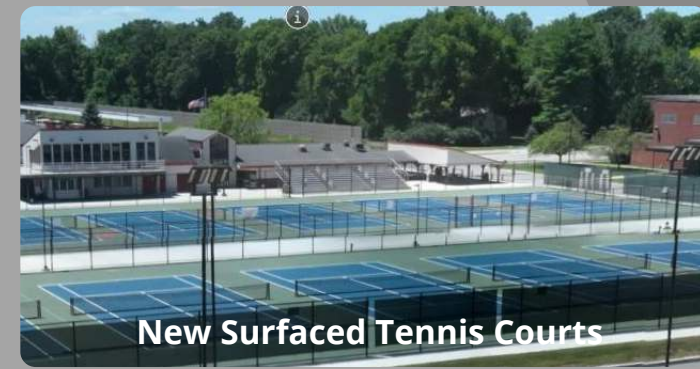
New Surfaced Tennis Courts