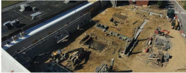
Mountain Brook Junior High School