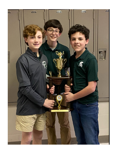
The MBJH Scholars' Bowl team placed third at the state level last weekend! Click here to read more about the team and their success.