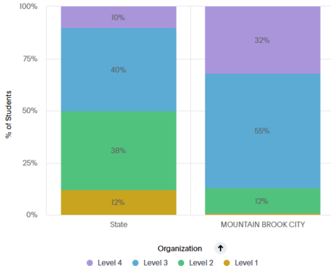
Summary of Performance by State and District