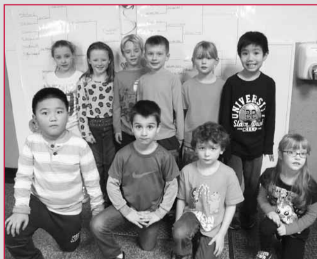
Second-grade Orange Eagles hockey team.

Students and faculty members from Mineola High School went head-to-head in Olympic-style games in an effort to raise money for St. Jude Children's Hospital. More than 16 student and faculty teams competed against each other in events such as volleyball, three-point shootout, relay races and goal kicking. Spectators were asked to donate $5 each, which raised more than $1,500 for the cause.